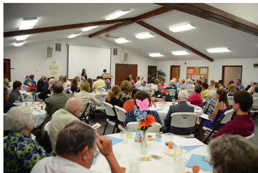
The Annual Scholarship Recognition Dinner was held at Peace Lutheran Church in May.