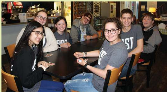
FIST members at Cahoots Game Night

FIST is a student-led organization, comprised of 19 students in grades 8-12 from Hamilton, Angola, and Fremont. They meet monthly to vote on grant requests and work together to make decisions about how they will serve the community. FIST members run the meetings, go through an agenda, and take minutes to note their discussions. SCCF offers administrative and financial support, helping them navigate the professional world as high school students with an interest in giving back.