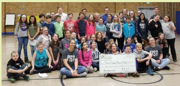
FIST members at Pleasant Lake Elementary School