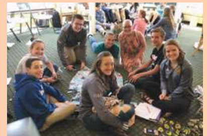
FIST members welcomed its newest members by making blankets for the Community Humane Shelter this spring.

while making Christmas cards, and presentations to middle school students to discuss the meaning of philanthropy. FIST also awarded 11 grants for a total of $7,485, which supported arts projects in Steuben County schools and other community needs. Over the course of the school year, FIST was able to engage 175 other youth in philanthropic activities.