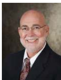
James W. Burns Chair