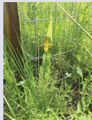
Reintroduced orchid species

grandmother always spoke about how much she loved the area they were planting.