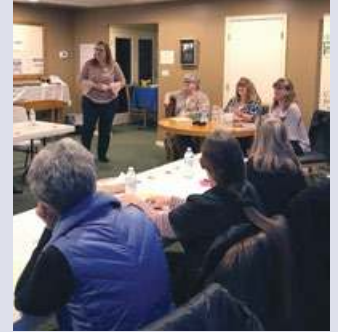
Quality Child Care gathering