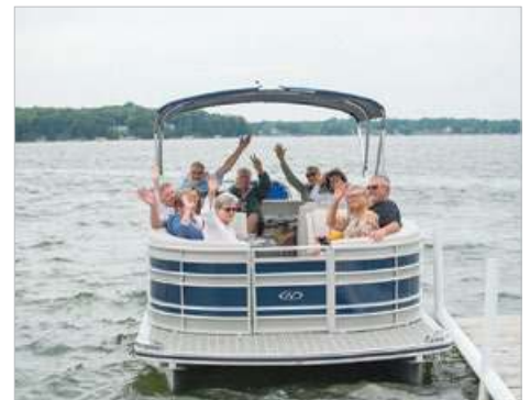
Here we go!