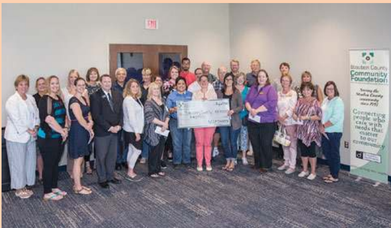
Designated grant recipients were well represented at the SCCF annual meeting.

Community foundations are often referred to as one of the best kept secrets in their towns. This year we decided to spill the beans. At our 2018 annual meeting, we shared the community impact made through automatic grants to nonprofits from some of our funds every year. SCCF distributed grant checks in excess of $300,000 to more than 50 nonprofit organizations serving Steuben County! Each year, nonprofit organizations use these grant funds for a variety of projects, including maintenance expenses, scholarships, program costs, and administrative expenses. Designated funds are established by donors who wish to support a charitable cause or organization every year with the earnings from permanently endowed funds.