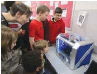
Fremont 7th grade class

Last year the Fremont Middle School Project Based Learning (PBL) class received a grant for a Dremel 3D40 3D printer through the Fremont Fund at SCCF and the Fremont Chamber of Commerce. This grant was a natural partnership for SCCF