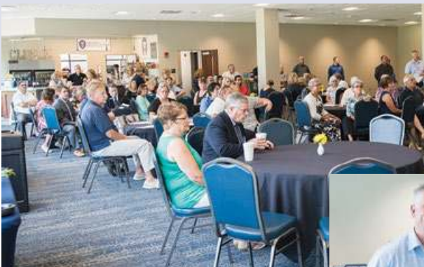
Many checks were presented to nonprofit organizations at the SCCF annual meeting.