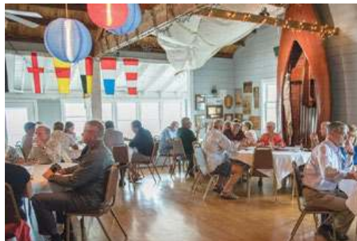
The event was held at the Clear Lake Yacht Club.

A "Kasota Island Adventure" was held in June at Clear Lake in appreciation of the service of SCCF board and committee volunteers.