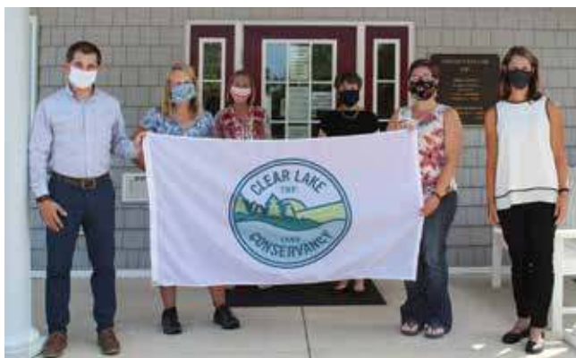
Clear Lake Township Land Conservancy