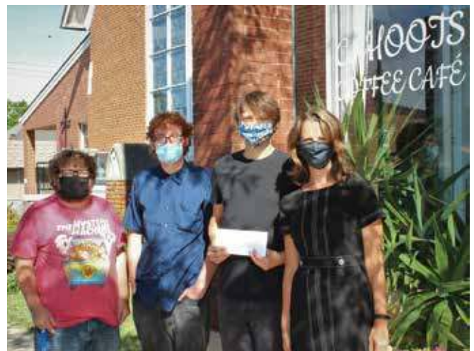
Cahoots Coffee Café