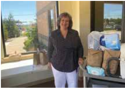
Cancer Services of Northeast Indiana

Indiana. Some of the grant recipients this year are from regional nonprofits who provide unique and high quality services in Steuben County, including Science Central, McMillen Health, and Erin's House for Grieving Children. Many of the grants awarded from this fund are for community-enhancing programs, like the Downtown