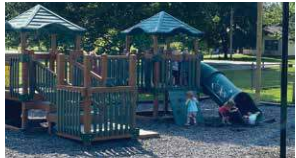
Lighthouse Montessori Education Center

In November 2020, Easterseals RISE and the Steuben County Economic Development Corporation received SCCF's first Impact Grant. This is a new, multi-year grant cycle for innovative, collaborative, sustainable projects that benefit the community. These two organizations are partnering to offer a pre-manufacturing academy, which provides a pathway for high school students, recent graduates, and adult learners to gain certifications and firsthand experience with a variety of manufacturing skills. Local businesses are sponsoring the student participants, which enables more people to participate in the program. Since receiving the initial $20,000 grant for this project from SCCF, the two organizations have leveraged support from additional funders and will graduate the first cohort of students from the program. For students from Easterseals RISE, who have intellectual or developmental disabilities, this program is a unique way for individuals to have more employment opportunities and earn an income. SCCF looks forward to seeing this program grow and supporting new, exciting projects through this impact grant cycle each year.