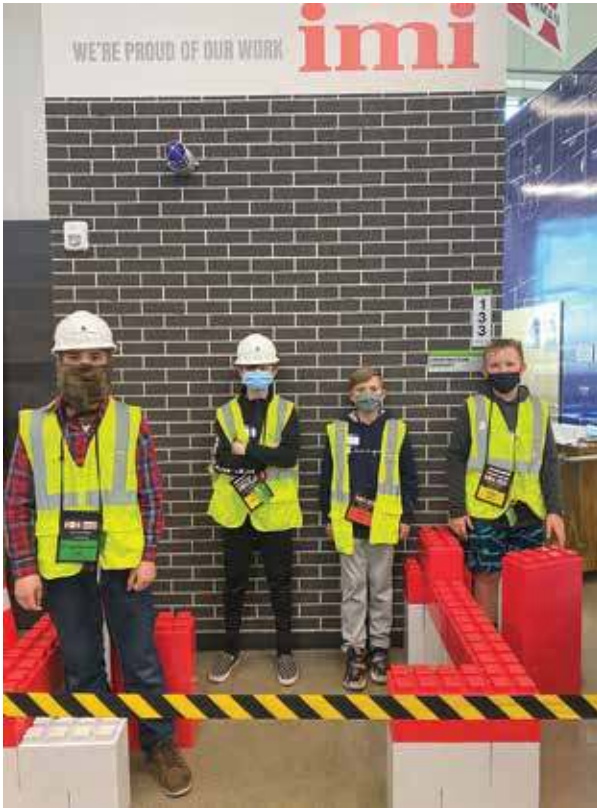
Junior Achievement serving Steuben County reached 117 classrooms and approximately 2,609 students in the 2020-2021 school year. JA teaches students about financial literacy, entrepreneurship, and career readiness skills. Teachers and volunteers presented lessons to students K-12th grade in all buildings across the district using virtual platforms and maintaining COVID standards. JA received a grant from the Steuben County Disaster Response Fund in 2021.