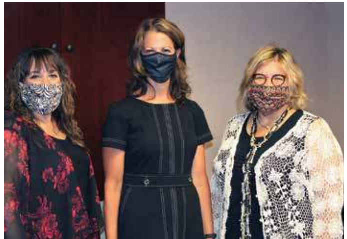
Downtown Angola Coalition

You can learn about these designated funds and more at https://steubenfoundation.org/funds/