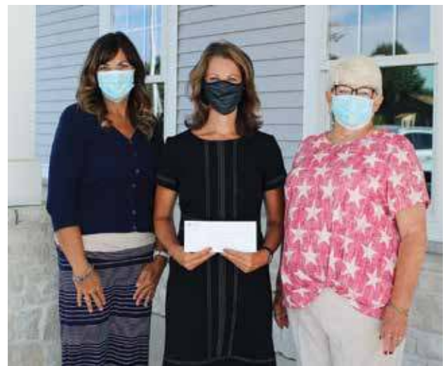
Steuben County Council on Aging