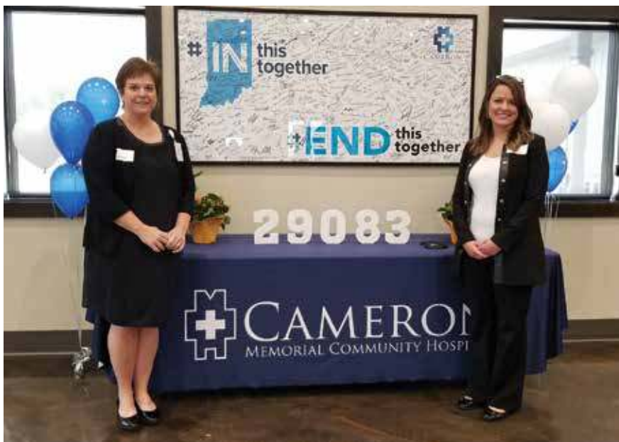
Cameron Memorial Community Hospital used their Steuben County Disaster Response Fund grant to offset the cost of purchasing a deep freezer, equipment setup, and ensuring there were paramedic and EMT personnel on site at the clinic. They administered more than 29,083 vaccinations at the event center clinic space.