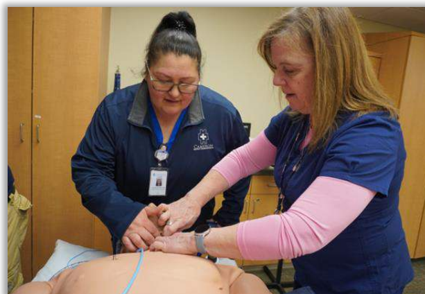
Cameron Memorial Community Hospital staff utilizes a computer-based medical manikin to practice medical procedures and diagnostic techniques in a realistic clinical scenario. Simulated learning reduces risk to patients.

The simulation lab creates unique programming for high-demand healthcare professions such as nursing through partnerships with Trine University, local schools, first responders, and community members.