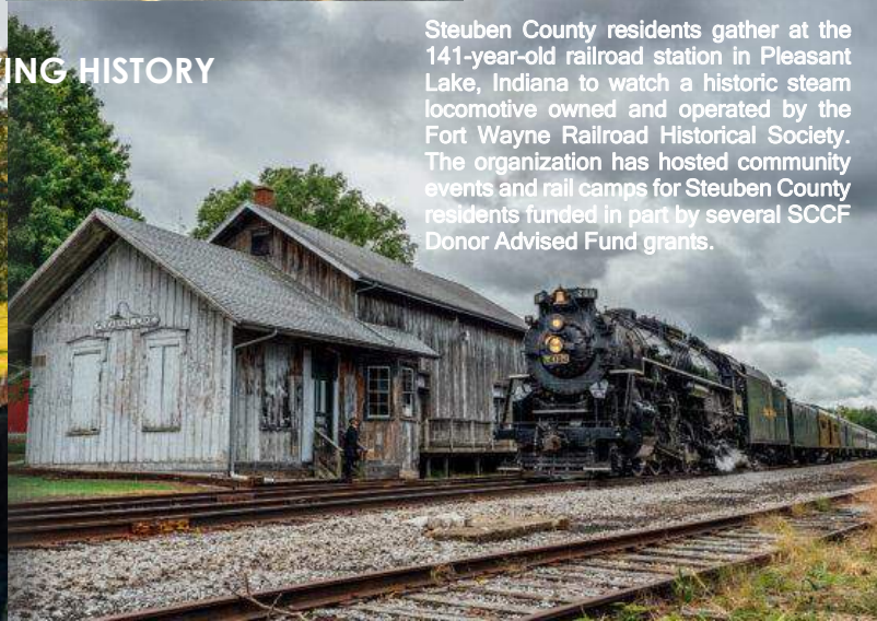
Steuben County residents gather at the 141-year-old railroad station in Pleasant Lake, Indiana to watch a historic steam locomotive owned and operated by the Fort Wayne Railroad Historical Society. The organization has hosted community events and rail camps for Steuben County residents funded in part by several SCCF Donor Advised Fund grants.