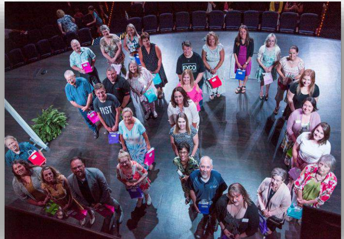
Photos from the 30 th Anniversary Celebration at Trine University's T. Furth Center for the Performing Arts.