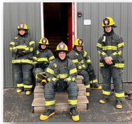
Area high school students participate in the Graduation Pathways fire science program.

MSD and AFD partnered with the Steuben County Economic Development Corporation in applying for a grant through the Steuben County Community Foundation. The SCCF grant in the amount of $21,000 helped cover some of the cost - approximately $5,000 per person - of required firefighting equipment. The program is open to students at all four Steuben County high schools. Students who complete the course will be firefighting certified in Indiana.