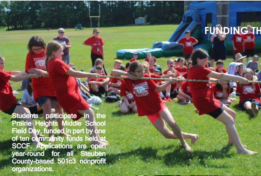
Students participate in the Prairie Heights Middle School Field Day, funded in part by one of ten community funds held at SCCF. Applications are open year-round for all Steuben County-based 501c3 nonprofit organizations.